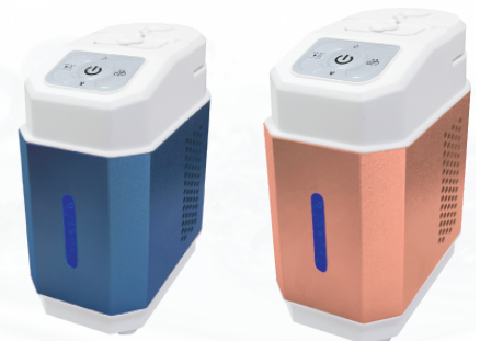
■ Ocean blue ■ Rose Gold